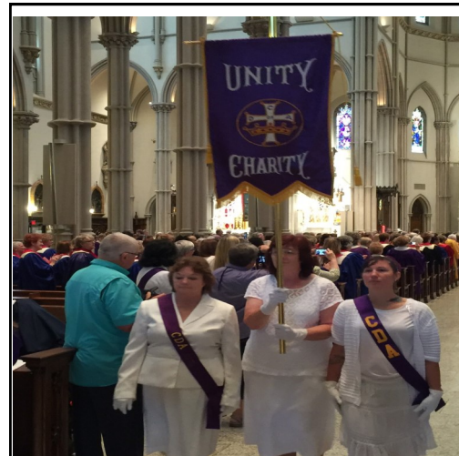
Thousands of dedicated Catholic Daughters attend mass, at St. Paul's Cathedral, Pittsburgh, PA.

Saint Teresa of Calcutta said, "Not all of us can do great things. But we can do small things with great love." We will plant the seed by being living examples of our Catholic faith to others. We may falter at times but ultimately our goal is to allow God to lead us to serve Him, in the way He chooses.