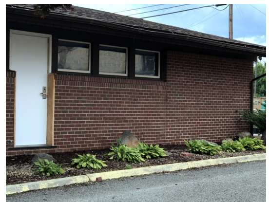
Landscaping beside the Pre-school and Pre-K building was completed by the CDA.

Meet with us on August 21st at 6 in parish meeting room.