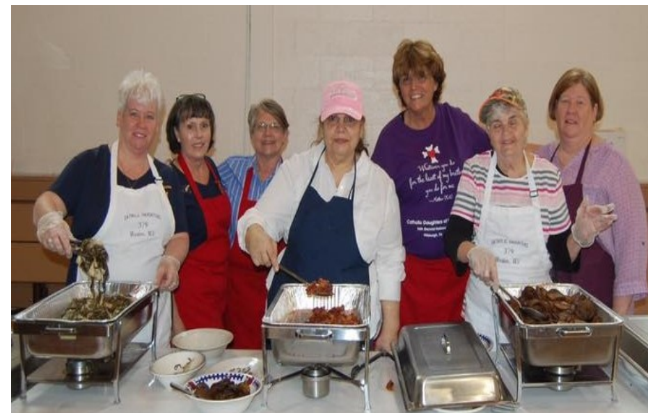
A few of the members who able to get a quick picture at the Ramp Dinner held on Sat., May 13. The dinner was sponsored by both the Knights of Columbus and the Catholic Daughters. It was one of the first combined effort in recent years of the two groups.