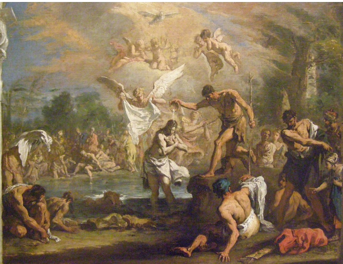
The Baptism of Christ by Sebastiano Ricci

The Baptism in the Jordan returns to the great Christmas theme of 'Christification,' Jesus of Nazareth's spiritual anointing, His presentation as the Anointed One par excellence, the Messiah or the One sent by the Father for the salvation of mankind. The Spirit that descended on Jesus shows and seals in an incontrovertible way the 'Christification' of Jesus' humanity that the Word had already fulfilled from the first moment of His miraculous conception by Mary. Jesus, from the very beginning, was always the Lord's Christ, He was always God. Yet, His one, true humanity, that which is perfect in every way, as the Gospel records, constantly grew in natural and supernatural perfection. 'And Jesus increased in wisdom, in stature, and in favour with God and with men' (Lk2:52). In Israel at 30 years of age, one reached full maturity and therefore could become a master. Jesus came of age and the Spirit, descending