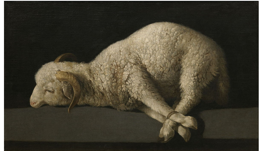
Agnus Dei (The Lamb of God), by Francisco de Zurbarán, c. 1635-1640

With regard to the content of his testimony, the Baptist identified Jesus as 'the Lamb of God who takes away the sins of the world' (Jn 1:29). Anticipating Jesus' messianic and salvific role, each of the four evangelists start their Gospels with the Baptist's words. The Lamb refers to the idea of salvation. The Lamb is the gift of liberation that, following the flight from Egypt, the Israelites sacrificed to the Lord. The Lamb recalls the servant of the