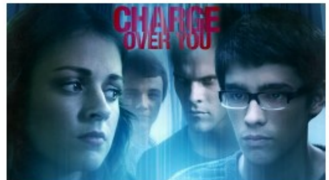
Charge Over You

St. Patrick Church has purchased a gift for you!