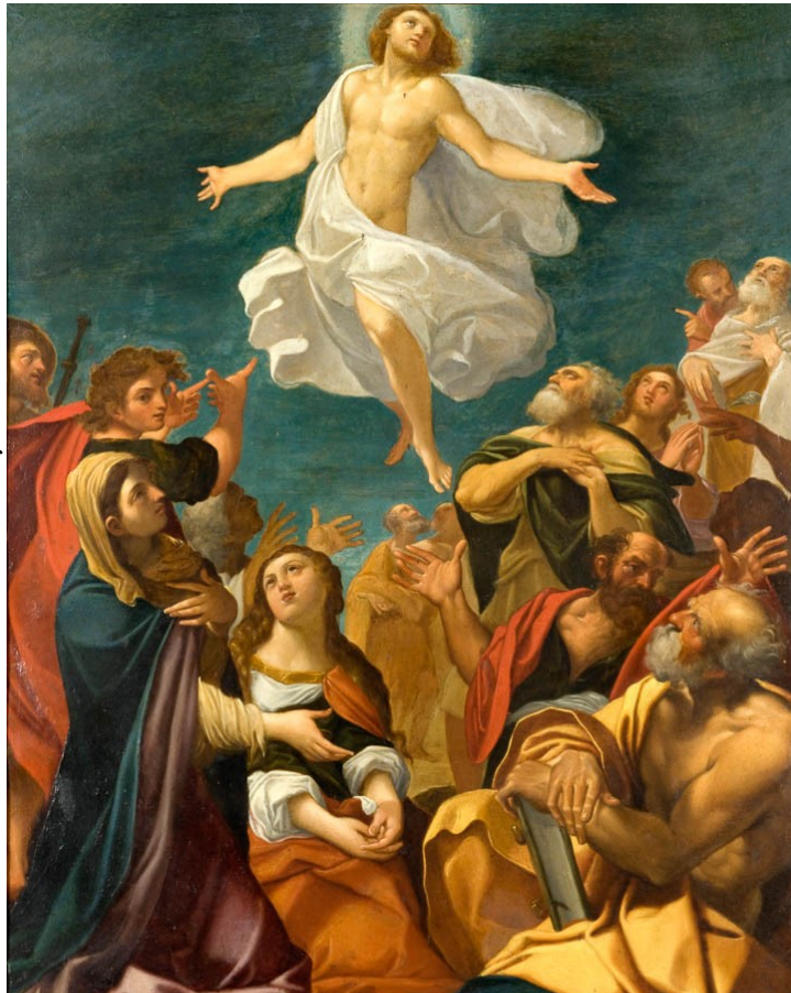
Ascension of Christ by Giacomo Cavedone

It was written, and foretold, that Christ should suffer and so enter into his glory. The servant is not above the Master. I too must suffer. I too must accept the hardships and the trials of this life, if I want, and I do, to enter into the life of glory. Christ, who was sinless, suffered hardship and pain. I have earned many, if not all of my hardships, by my own sins. I should be glad of the opportunity to make some atonement for my past offenses, by willingly accepting the crosses he sends me. These crosses are signs of God's interest in my true welfare. Through him he is