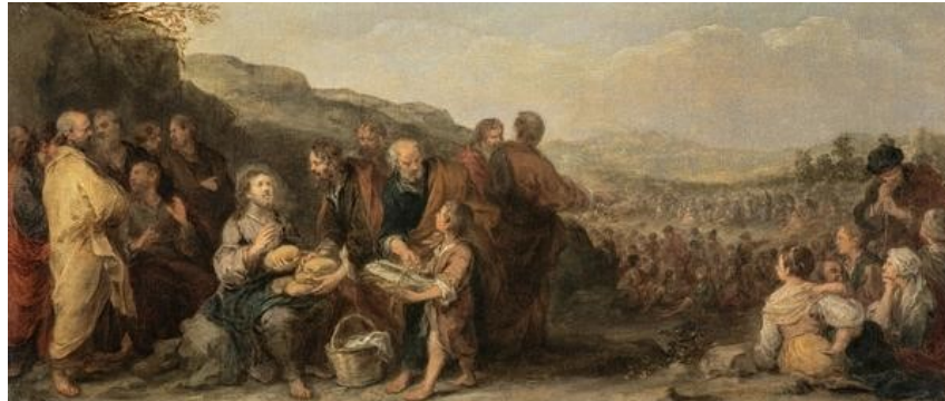
The Miracle of the Loaves and the Fishes by Bartolome Esteban Murillo

The Galileans were grateful to Him for providing so kindly and so thoughtfully for their needs. How much more grateful should we not be for the miracle by means of which He has left us Himself to be our daily spiritual food? We are grateful, of course, to our loving Lord who not only handed up His Body to His enemies to be crucified for us, but through His divine power, arranged that His glorified body, triumphant over death, should remain with us, His Church, forever under the Eucharistic species.