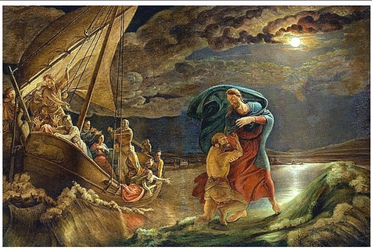
Peter Walks on Water, 1806, Phillip Otto Runge

This they will do, if we accept them and bear with them until He comes to our aid. Our troubles in life are like the growing pains of our youth — they are necessary if we are to arrive at our full