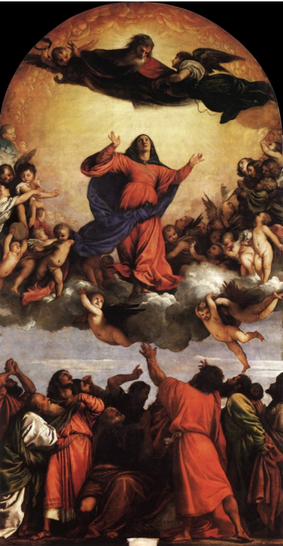
The Assumption of the Virgin, 1516-18 by Titian

Soon the name was changed to the "Assumption of Mary," since there was more to the feast than her dying. It also proclaimed that she had been taken up, body and soul, into heaven.