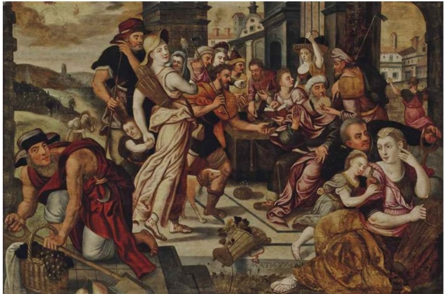
“The Parable of the Workers in the Vineyard (Matthew 20:1-16)” by Follower of Frans Floris the Elder, (Flemish, b. ca. 1519–1570)

The Gospel is from St. Matthew 20:1 -16a. The call to the vineyard (to the Church), through God's gift of faith and the sacrament of baptism, is a gift for which we can never sufficiently thank God. If we remain in the vineyard and labor honestly, that is, if we cooperate with the actual graces God is continually giving us, we are assured of reaching heaven when our earthly days are ended. The work we have to do in God's vineyard is the fulfilling of the duties of our state in life. By carrying out these duties faithfully and honestly we are doing the will of God and earning heaven. The greater part of our day and indeed of our life, will be taken up with tasks of themselves worldly, but these tasks when done in the state of grace and with the intention of honoring God, have a supernatural value. For this we