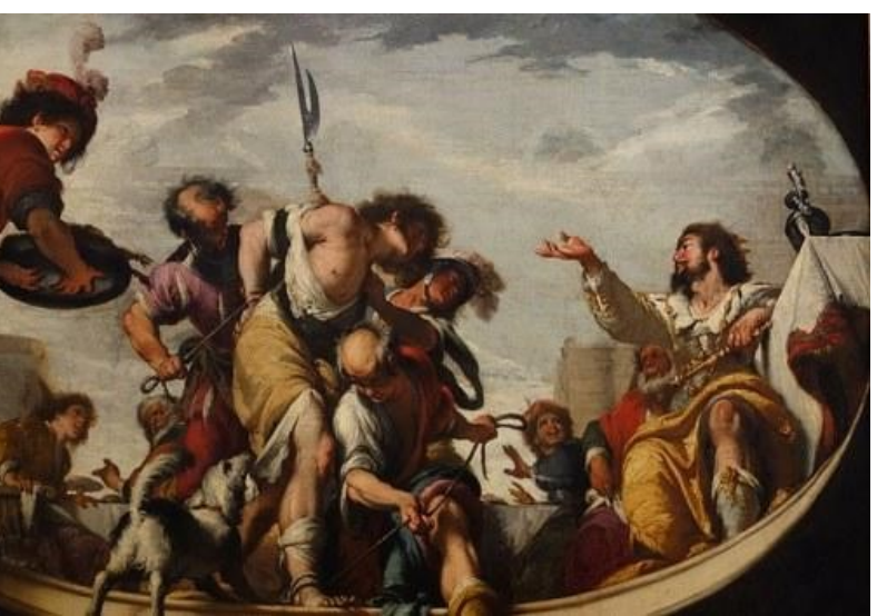
"The Parable of the Invitation to the Wedding" by Bernardo Strozzi

impede us too, unless we are on our guard. The world with its allurements is very close to us; heaven seems very far away. Thus we must be prepared to do violence to our ordinary inclinations, to go against them whenever and wherever "the things that are Caesar's" tend to blot out or make us forget "the things that are