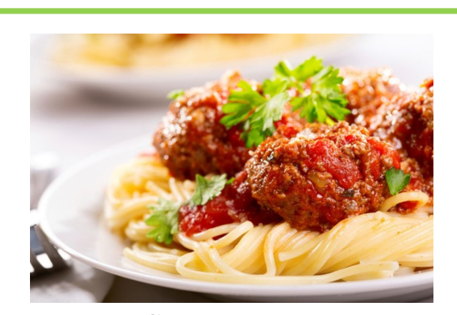
Save the Date

Different sizes are available, The sizes are written on the zip lock bags they are in. Currently there are just a few of the different sizes available but more will be available as they are made. Masks are free. Please remember to take them with you when you leave Mass.