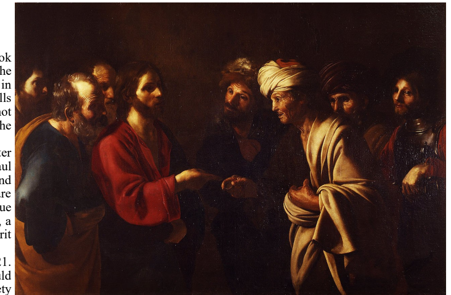
"Tribute to Caesar" by Bartolomeo Manfredi