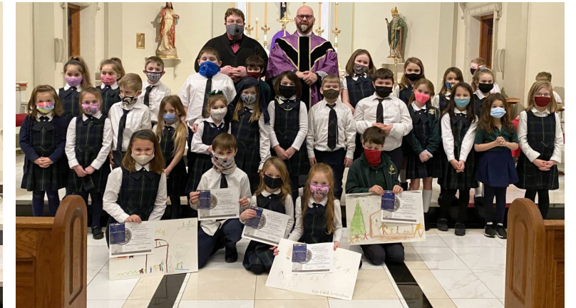
All participants that were recognized at Mass on February 19.