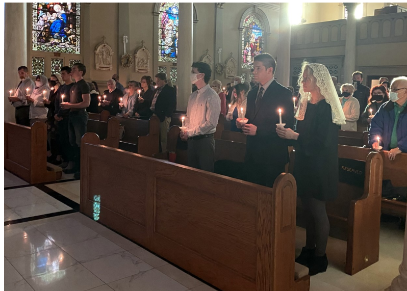
The congregation being the light of Christ.