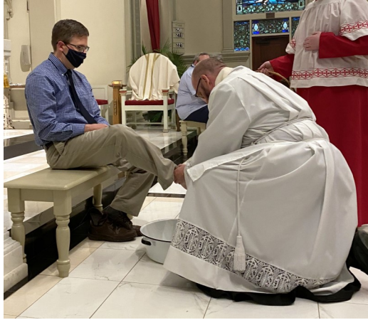
Father washes and kisses feet at Mass.