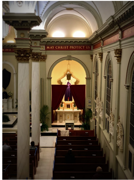
The night watch.