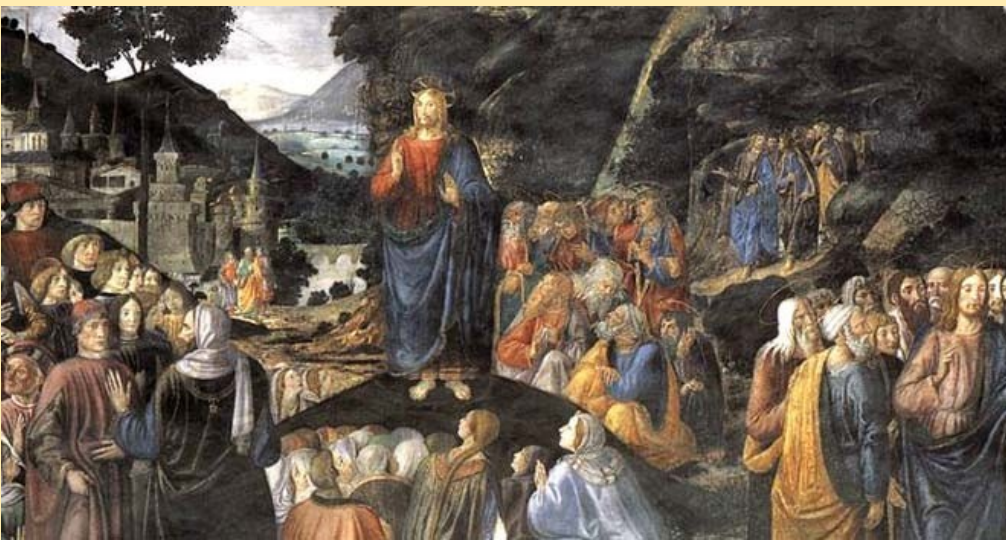
"The Sermon on the Mount" by Cosimo Rosselli 1439 – 1507

How far can human ingratitude and thanklessness go? Christ told us, through the disciples on Holy Thursday night, that he had made us his friends, his intimates. We are no longer servants in the household, who merely earn their daily wage and have no intimacy with the family and no hope of ever sharing in