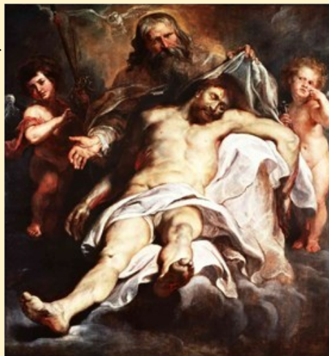
The Trinity by Peter Paul Rubens

Symbols of the Trinity: Equilateral Triangle; Circle of Eternity; Three interwoven Circles; Triangle in Circle; Circle within Triangle; Interwoven Circle and Triangle; Two Triangles interwoven in shape of Star of David; Two Triangles in shape of Star of David interwoven with Circle; Trefoil; Trefoil and Triangle; Trefoil with points; Triquetra; Triquetra and circle; Shield of the Holy Trinity; Three Fishes linked together in shape of a triangle; Cross and Triangle overlapping; Fleur de Lys; St. Patrick's Shamrock.