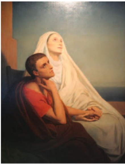
Saint Augustine and Sainte Monica, 1858 by Ary Scheffer (1795–1858)