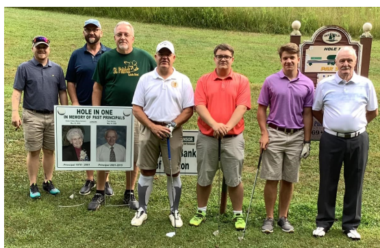
Above: These two teams smiled for a picture before taking on the hole in one challenge.