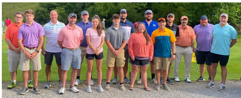
Right: Some of our St. Patrick School alumni played in the golf tournament.