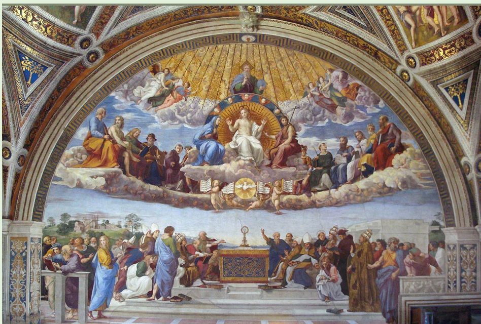
Disputation of the Sacrament by Raphael, 1509-1510

No one who accepts Christ for what he is, the Son of God in human form, has any difficulty in believing that he left us himself in the Eucharist as a sacrifice and a sacrament. This does not mean that we understand this gift of Christ in all its details—it was an act of divine power and as such beyond full human comprehension. However, we can understand enough about the actuality of the Eucharist because we accept the words of Christ, who "has the words of eternal life," even though its innermost nature escapes us. We are doing no violence to our intelligence when we accept as fact from a trustworthy witness what we cannot prove or confirm for ourselves. No more trustworthy witness than Christ ever existed. In Galilee he promised to give his body and blood in the Eucharist—to be our spiritual nourishment — communion — and our means of offering an absolutely pleasing sacrifice to God every time his