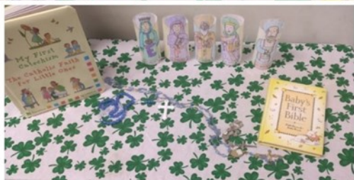
Pre-K's saints of the Week