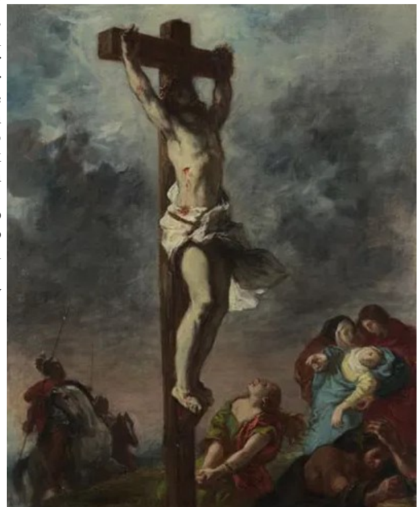
Christ on the Cross by Eugene Delacroix, 1846