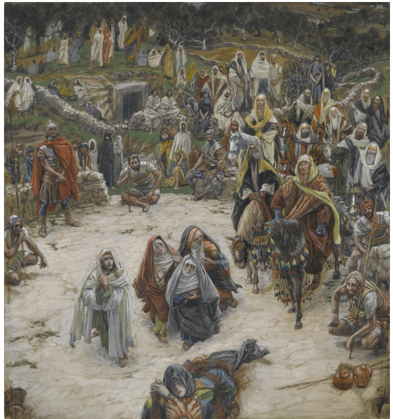
View from the Cross, by James Tissot

https://www.artbible.info/art/large/495.html