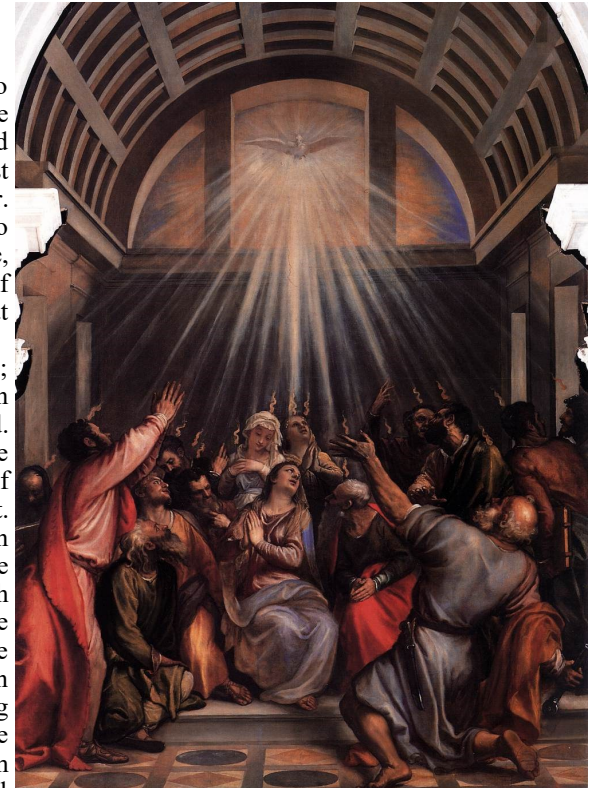
The Descent of the Holy Spirit by Titian, 1545,

Pentecost is the birthday of the Church and of Christianity, the beginning of the New Dispensation. Man, having been touched by the Spirit, no longer lives according to the flesh, according to the principles and ideals of fallen human nature; he lives in the Spirit. He is filled with the light of truth and is guided by the Spirit of truth Himself, the Holy Spirit. The new generation of men now sees all things in their proper place in the plan of divine providence and in their relationship to eternity. In the spirit of truth and love the new generation is called to act for