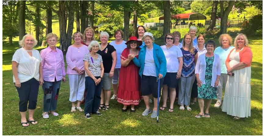
Members at the picnic gather for a group picture.