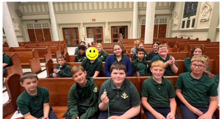
Fifth & Sixth grades