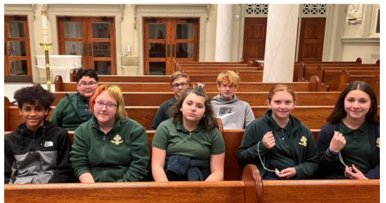
Seventh & Eighth grades

Our Lady of the Most Holy Rosary, Pray for Us!