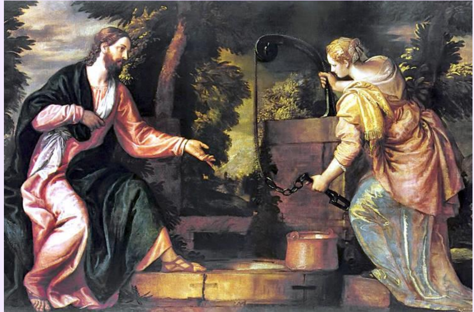
“Christ and the Woman of Samaria” (detail) by Paolo Veronese