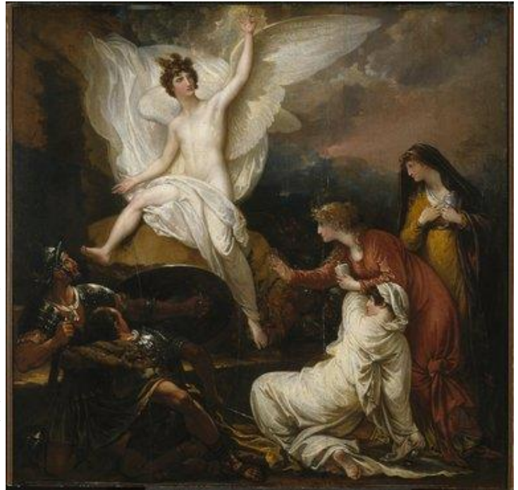
"The Women at the Sepulchre (The Angel at the Tomb of Christ) (1805)

Halleluia! All glory, praise and honor to You, Most Glorious Lord Jesus! You have risen from the grave, You have conquered sin and death, You have opened the gates to Heaven! Halleluia! All praise and honor to You, Most Glorious Lord Jesus!