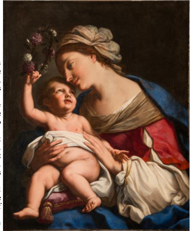
Virgin and Child , 1663, Elisabetta Sirani