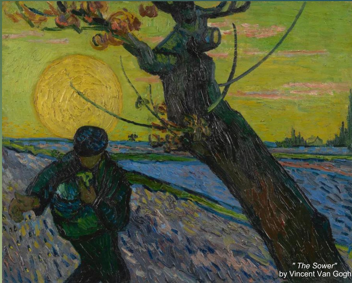
"The Sower" by Vincent Van Gogh

"You shall indeed hear but not understand, you shall indeed look but never see. Gross is the heart of this people, they will hardly hear with their ears, they have closed their eyes, lest they see with their eyes and hear with their ears and understand with their hearts and be converted, and I heal them."