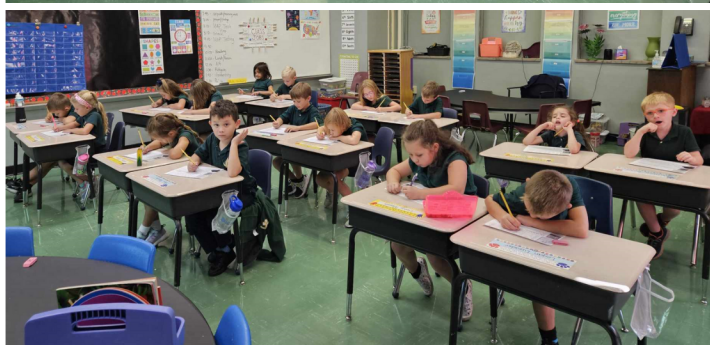
Ready for the Weekend.