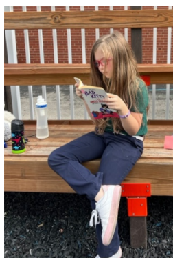
Two Different Approaches to Recess