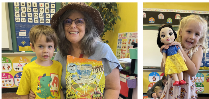
Pre-K Show and Tell for the Letter S = Sandy, snacks, Snow White, stethoscope, and Strawberry Shortcake