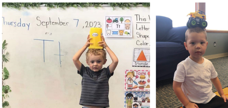
Pre-School Show and Tell for the Letter toilet and tractor