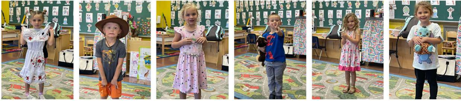
Pre-K has their first show-and-tell of the year, sharing with their class something from the summer.