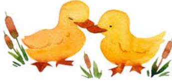
Kindergarten enhances their reading skills by creating the setting and characters from the book, "Little Quack's New Friend" out of play-doh.