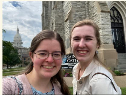
St. Mary's Cathedral, Lansing, MI