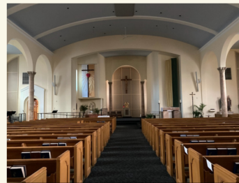
St. Thomas, Grand Rapids, MI