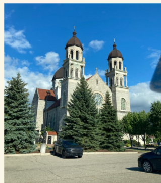
Basilica of St. Albert, Grand Rapids, MI