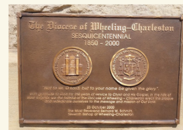
Basilica Of The Co-Cathedral Of The Sacred Heart, Charleston