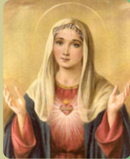
The month of August is dedicated to The Immaculate Heart of Mary.

Some of us here present may be among these foolish ones. We may have let this world get such a grip on us that we have no time or thought for the world that is to come. For such foolish people, and indeed for all of us, today's warning is that our call to judgment will come on each one of us like a thief in the night, at a moment when we least expect it. This need not be a sudden death. Of every thousand who die after long illnesses in our hospitals, there rarely is one who knows and admits he is about to die, so actually all deaths are sudden, that is, unexpected.