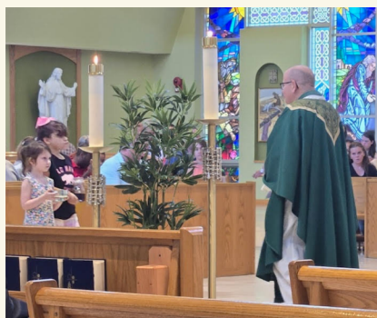
Saint Columbkil Parish in Boyertown, PA.